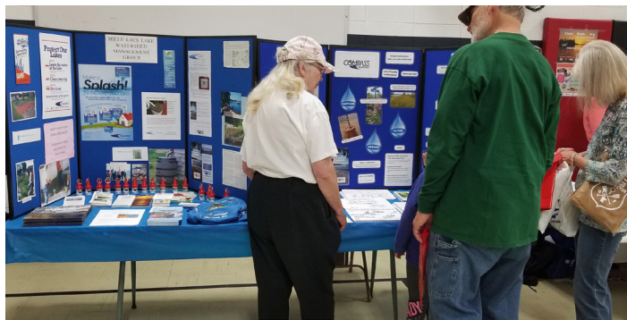
The Compass Program had a booth at the 2019 Rivers and Lakes Fair in Aitkin.